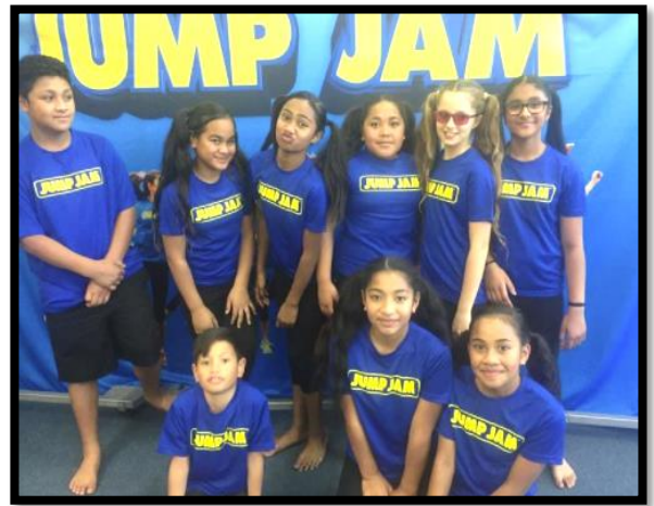
Jump Jam team

Sports fees are due now, please pay at the office.