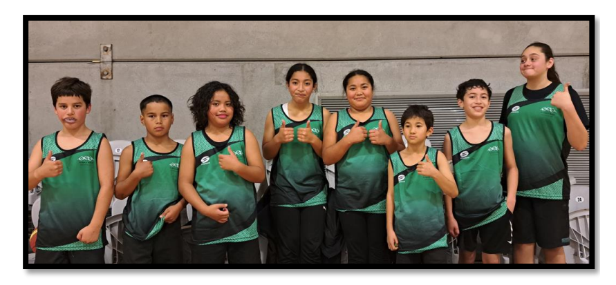
Wairau Wairua with our new sports uniforms from Strudddys.

Reminder - to please pay your Sports Fees - Basketball Fees are $45 and Netball is $25. Please pay at the office. Thank you to those who have already paid their Sports fees.